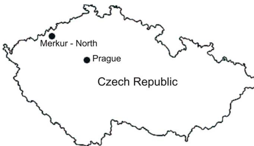
Fig. 1. Localization of Merkur–North locality.

Obr. 1. Geografická pozícia lokality Merkur–Sever.