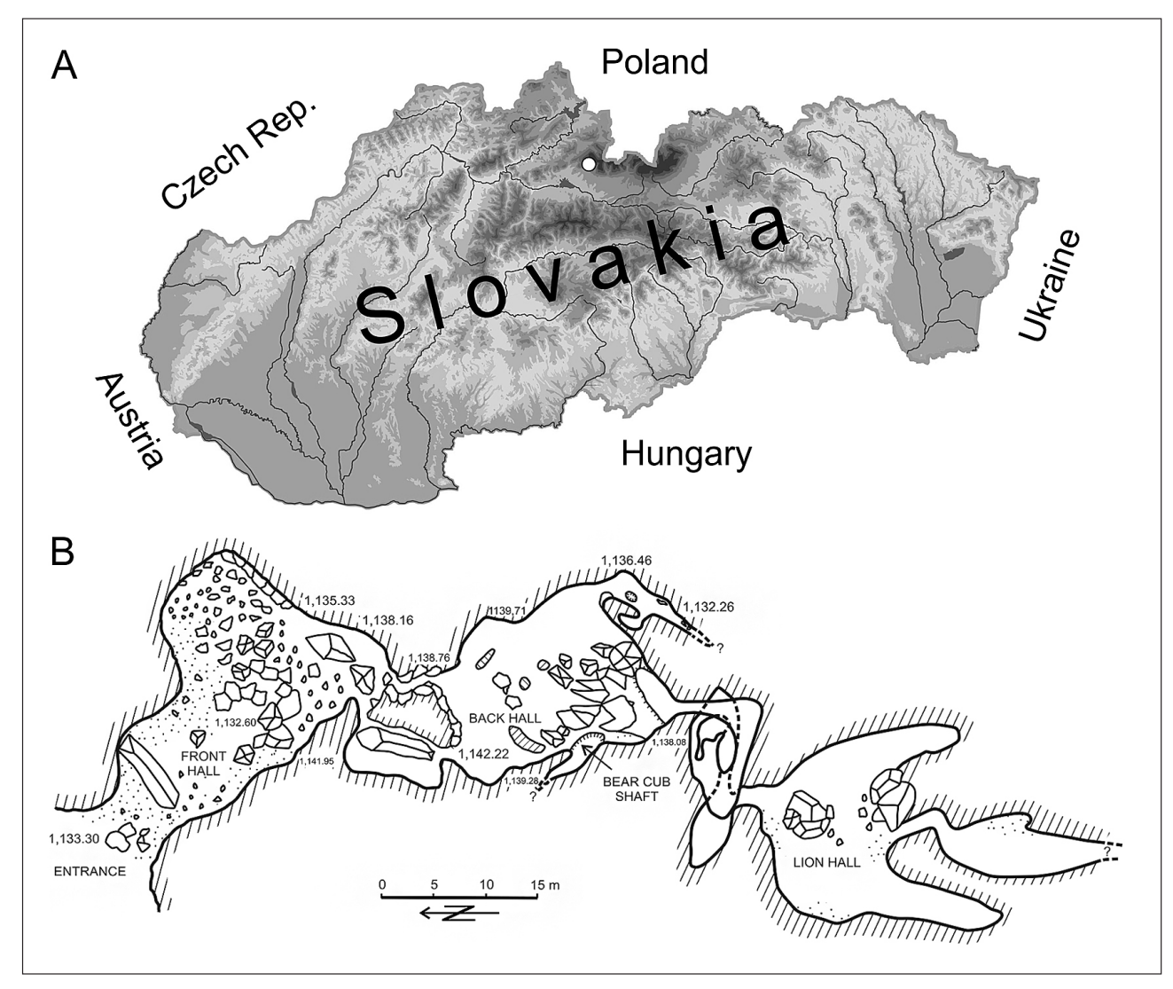
Fig. 1. Medvedia jaskyňa Cave in the Západné Tatry Mountains, Slovakia. A –location of the cave (white circle); B –ground plan of the cave (modified according to Droppa et al., 1966 ex Droppa, 1972).

originates from <sup>14</sup>C data being converted to age by the radioactive decay equation, radiocarbon half-life and the assumption that the atmospheric <sup>14</sup>C content is constant over time. Unfortunately, the atmospheric content is not constant and radiocarbon in the atmosphere is produced by interaction of neutrons with nitrogen, while the neutrons are produced by galactic cosmic rays entering the atmosphere. To cope with this, a calibration curve was established using independent dating methods including dendrochronology, varve counting, and speleothem and coral uranium-thorium dating. This method also has limits because less than 1 per mille of the original <sup>14</sup>C remains after 10 half-lives (half-life of 5,730 ± 40 years). Therefore, no material older than 50,000 years can be reliably dated with this method (Olsson, 2009; Reimer et al., 2013). Calibrated raw dates are indicated by calBP.