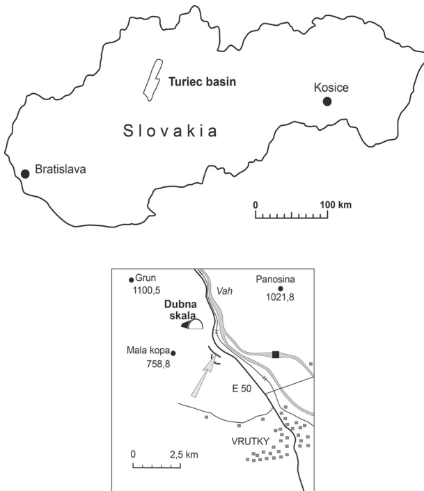
Figure 1: Geographic position of the Turiec Basin in Slovakia and geographic sketch of the Dubná skala cross-section.

The locality consists of two cross-sections. The first is an ancient abandoned quarry with vertical walls and has a particularly difficult access. The cross-section exposes massive bedded and laminated limestone slightly dipping to the basin centre.